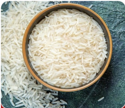
1121 STEAM SELLA BASMATI RICE 50 KG, 25 KG

IR64 is a semidwarf indica rice variety Parboiled rice is also a source of iron and calcium. Compared to white rice, parboiled rice has fewer calories, fewer carbohydrates, more fiber, and more protein