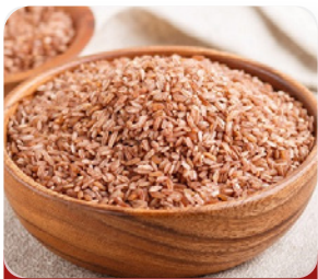
LONG GRAIN BROWN RICE 25 KG, 50KG

Black rice, also called forbidden rice or "emperor's rice," is gaining popularity for its high levels of antioxidants and superior nutritional value. 1 Forbidden rice earned its name because it was once reserved for the Chinese emperor to ensure his health and longevity and forbidden to anyone else.