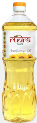
SUNFLOWER COOKING OIL 1.5 LITR