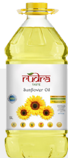
SUNFLOWER COOKING OIL 5 LITR