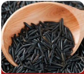
BLACK RICE 25 KG, 50KG

Black rice has a low glycemic index of 42.3 and it contains essential vitamins and nutrients. It is rich in fiber, protein, antioxidants, and minerals, making it a healthy addition to a diabetic diet.