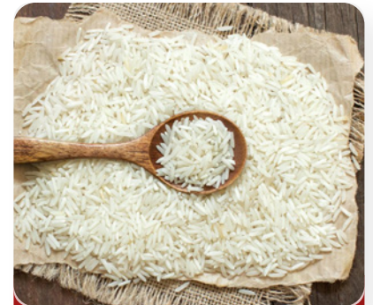
CREAMY SELLA BASMATI RICE 25 KG, 50KG