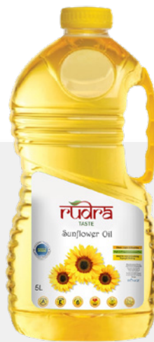
SUNFLOWER COOKING OIL 3 LITR