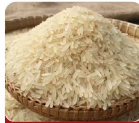
IR64 PARBOILED RICE 25 KG, 50KG

Sona Masoori is an aromatic and lightweight medium-grained rice known as the "Pearls of South India,". With its delicate flavor, it is the perfect choice for Pongal, coconut rice, steamed rice or as a compliment to South Indian Curries.