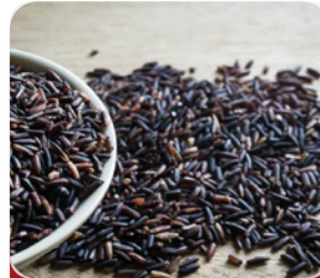
BLACK GLUTINOUS RICE/ FORBIDDEN RICE 25 KG, 50KG

Black rice has a low glycemic index of 42.3 and it contains essential vitamins and nutrients. It is rich in fiber, protein, antioxidants, and minerals, making it a healthy addition to a diabetic diet.