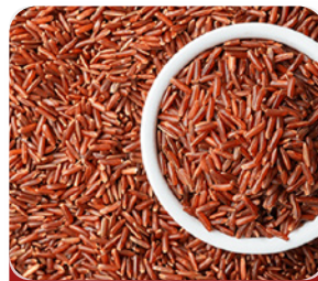
RED RICE 25 KG, 50KG

It's a rich source of dietary fiber, which can reduce your risk of death from heart disease. Brown rice also contains high levels of magnesium, which can help make you less vulnerable to heart disease and stroke.