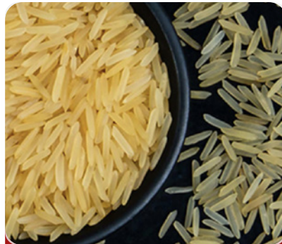
1121 GOLDEN SELLA BASMATI RICE 25 KG, 50KG